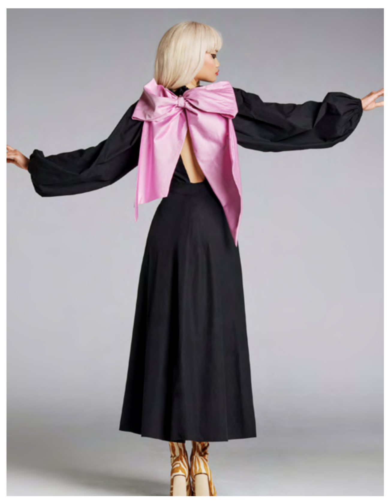
Look\ 3 - Black Cotton Poplin Dress with a Detachable Back Bow AW22