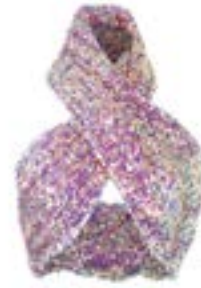
Iridescent purple bandana top