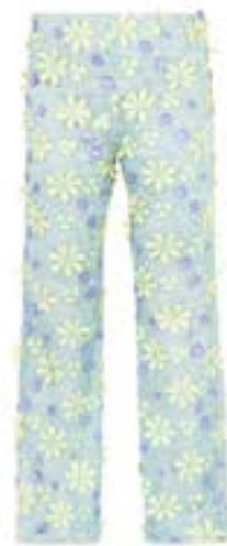
Floral embroidered pants