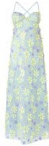
Floral embroidered maxi dress