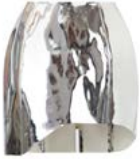
Silver vinyl asymmetric mini skirt