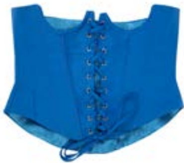
Blue corset belt