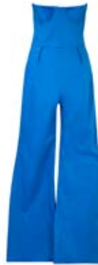
Blue cupless corset jumpsuit