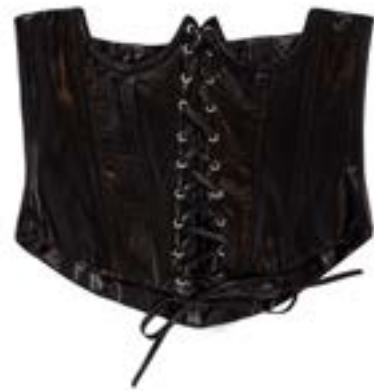
Black vinyl corset belt