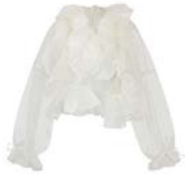
White organza blouse