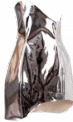
Silver vinyl asymmetrical dress