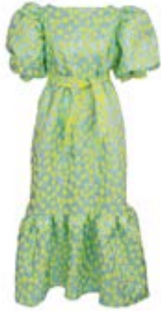
Green floral jacquard dress