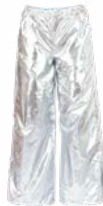
Silver wide leg pants