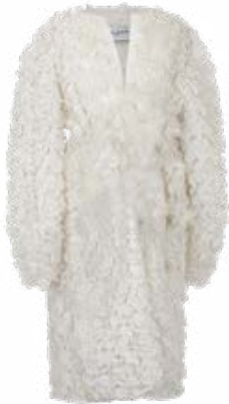
Floral longline coat