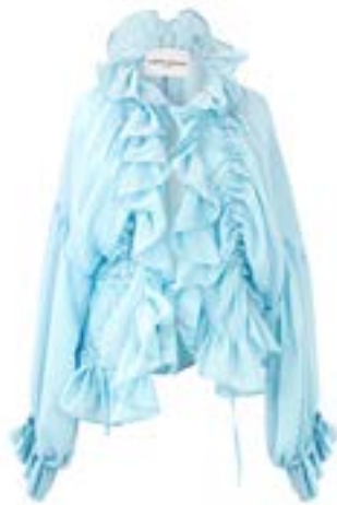
Blue ruffle blouse