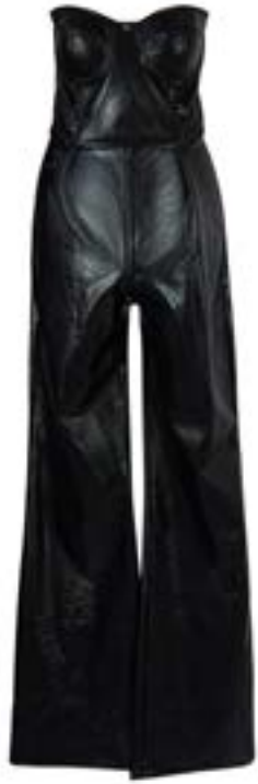
Black vinyl corset jumpsuit