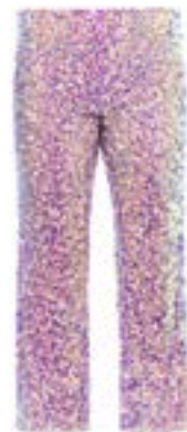
Purple iridescent sequin pants