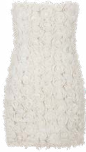
Floral mini bandeau dress