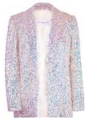
Iridescent sequin blazer