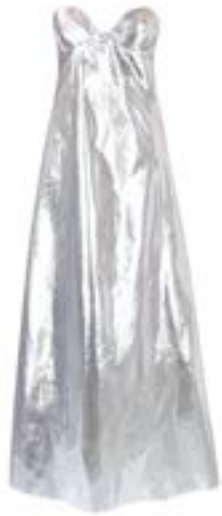
Silver maxi dress