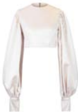
Cropped balloon sleeve blouse