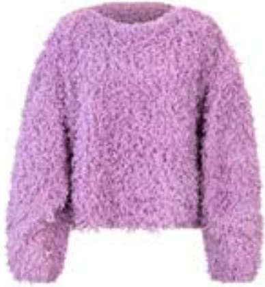
Purple fluffy jumper