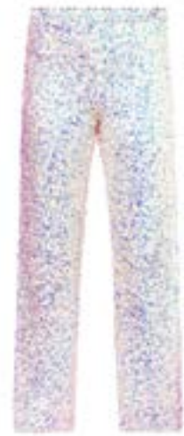
Iridescent sequin pants